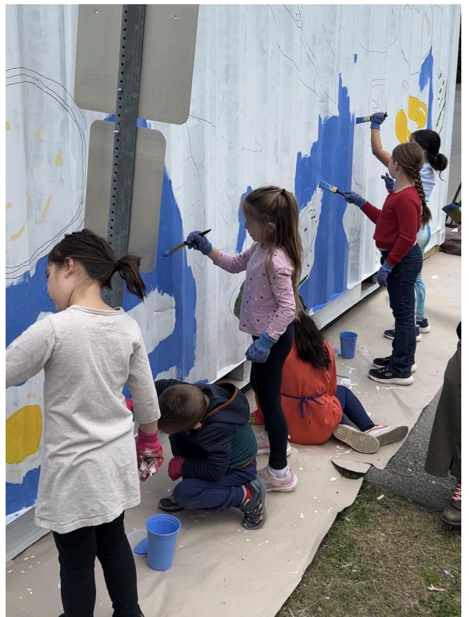
Kids helping to paint the mural