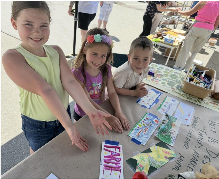
Kids drawing their ideas for the mural