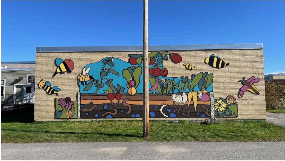
Downeast School Mural, 2025