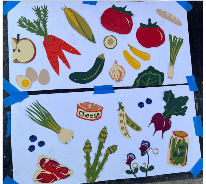
Mural design developed by Bangor Beautiful