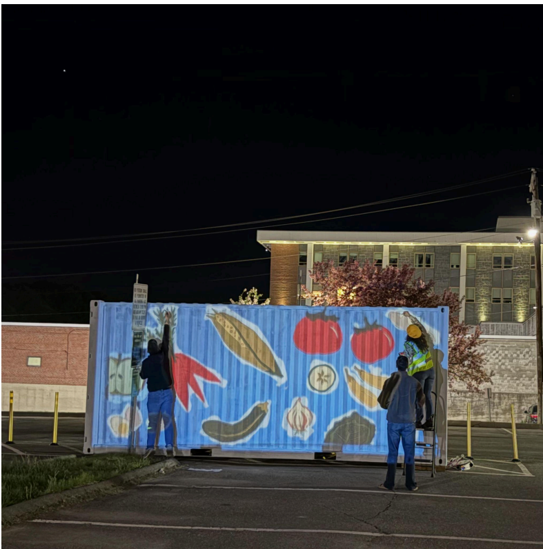
Volunteers projecting and outlining design