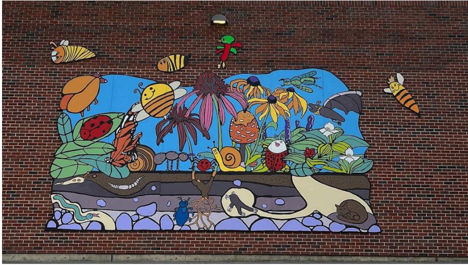
Abe Lincoln Mural, 2024