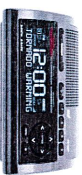
WR400 Deluxe NOAA Weather Alert Radio