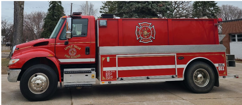
2008 International/Heiman Tender