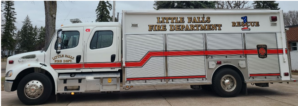
2005 Freightliner/Rosenbauer Heavy Rescue