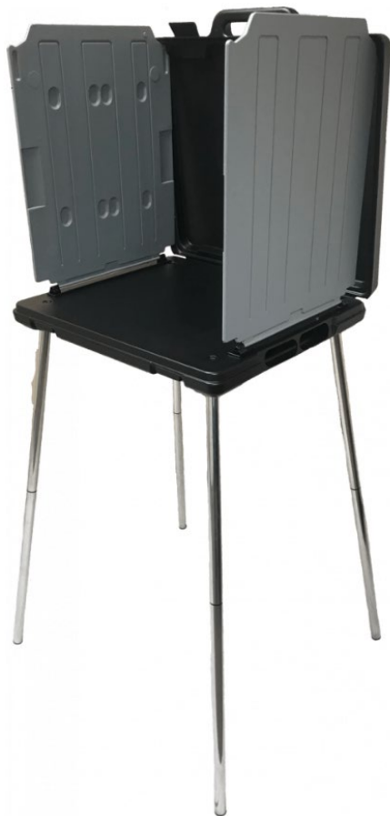
Starfire Hard Screen Standard Voting Booth