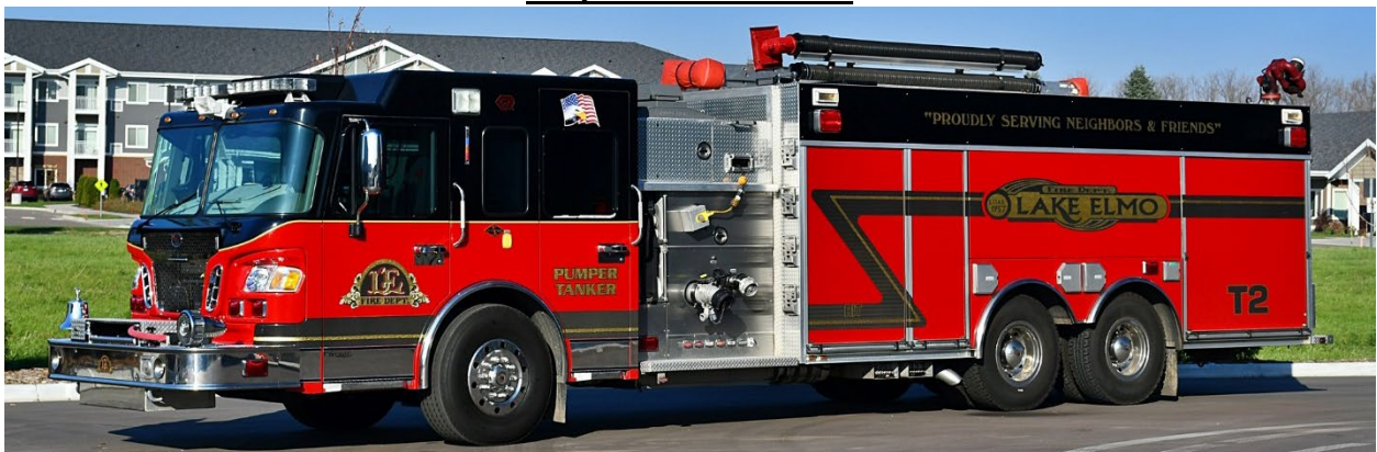
2007 Spartan/Rosenbauer Pumper/Tender