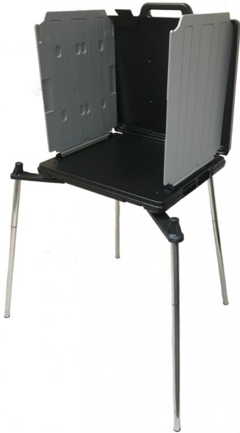
Starfire Hard Screen ADA Voting Booth