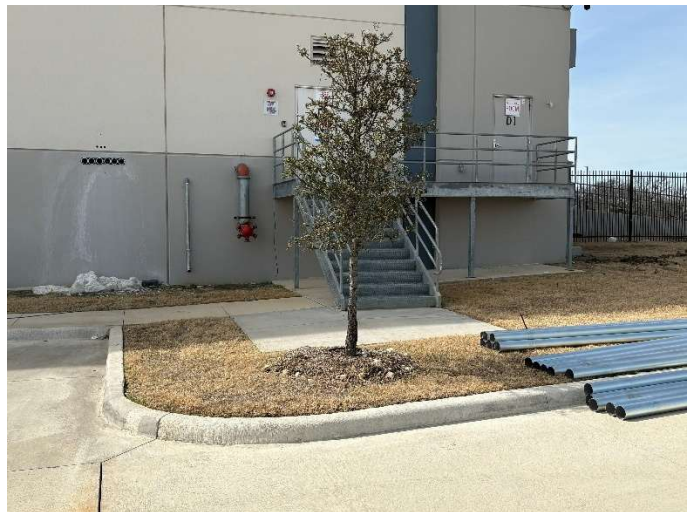
CTDI Haslet – 405 Westport Parkway- interior work currently underway. CO2 Tank has been installed on south side and connected to building. Generator installation has started on east end of building.