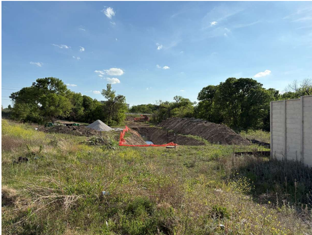
TRA/City Wastewater Interceptor Line Improvements adjacent to Stream HEN-2 under and north of Westport Parkway