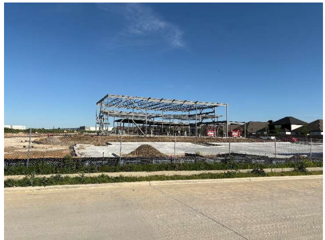
Cross City North Church Site Work Haslet Parkway at Sweetgrass Blvd.