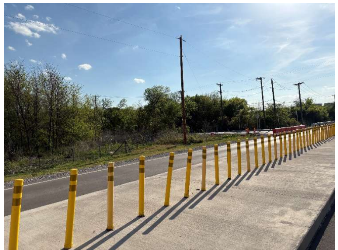
Keller – Haslet Road Improvements at North Main