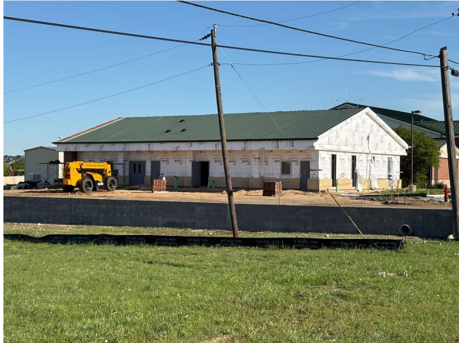
Haslet Fire Station Improvements