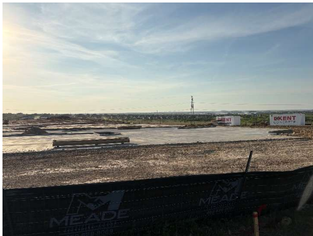
Site Improvements for Freeman Toyota located east of Harmon Road and West of IH35W