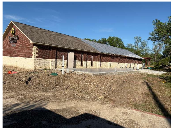
Grace Point Church Improvements adjacent to Schoolhouse Road