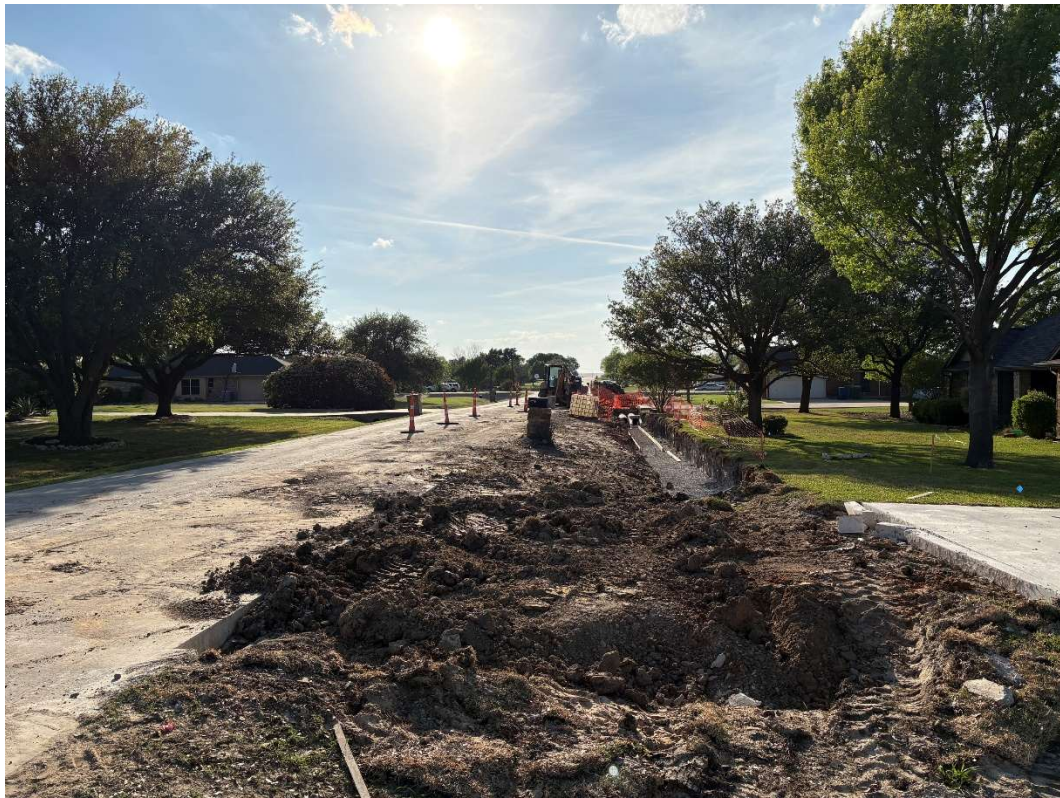
Street and Drainage Improvements on Schreiber Drive