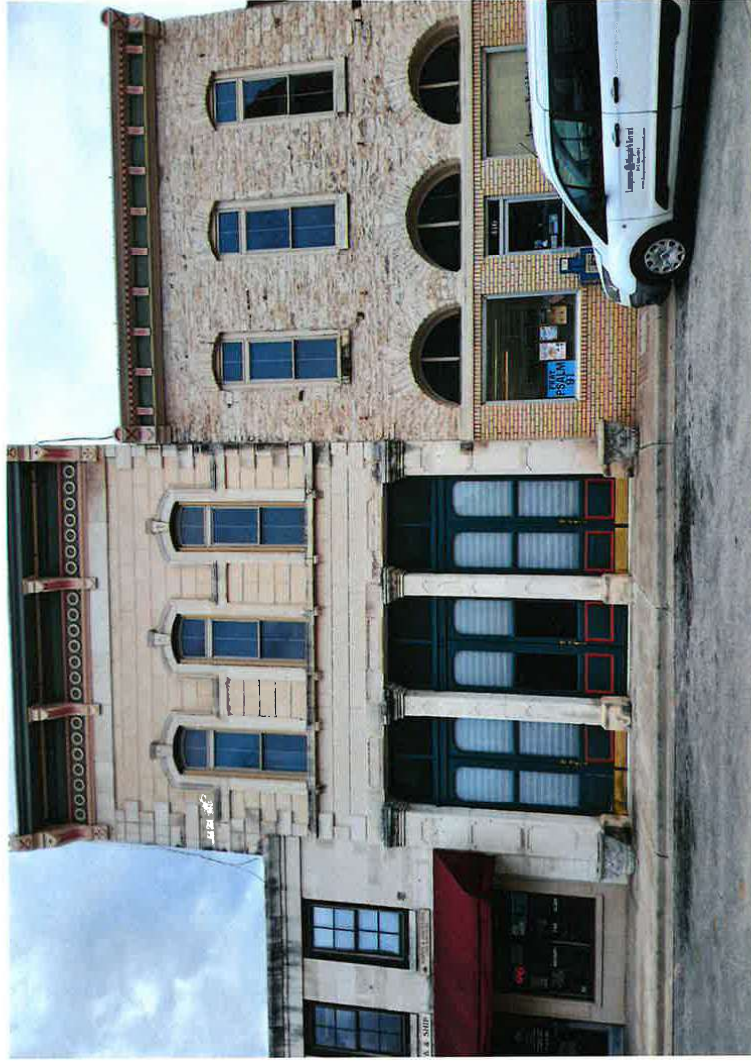
Photo of the current buildings; major renovation to tall doors, but more work in progress as of 4-6-26.