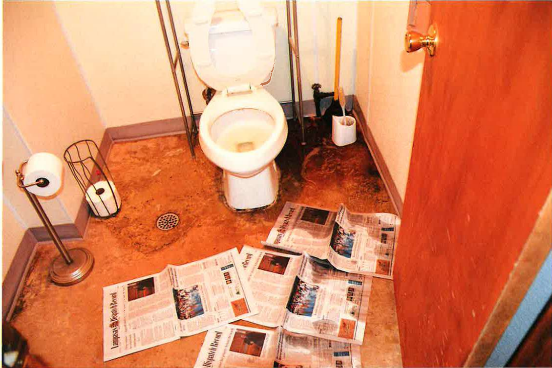
Damage to bathroom after water came through roof and ceiling after heavy rains in spring of 2025.