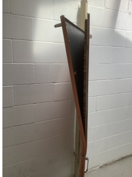
Cable Bridge Encampments