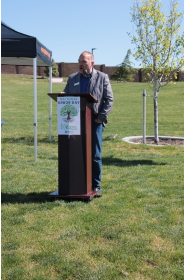
Palomino Park Planted 4 Evergreen Trees Leylandi Cypress