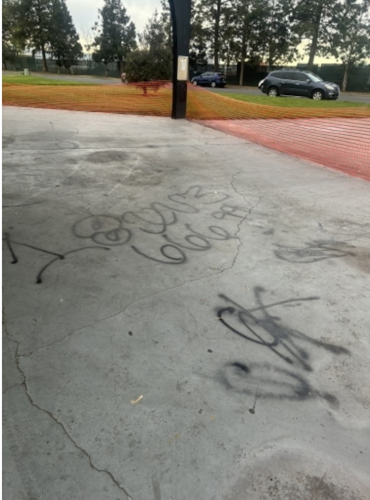
Kurtzman Park Additional drawings that are inappropriate to show.