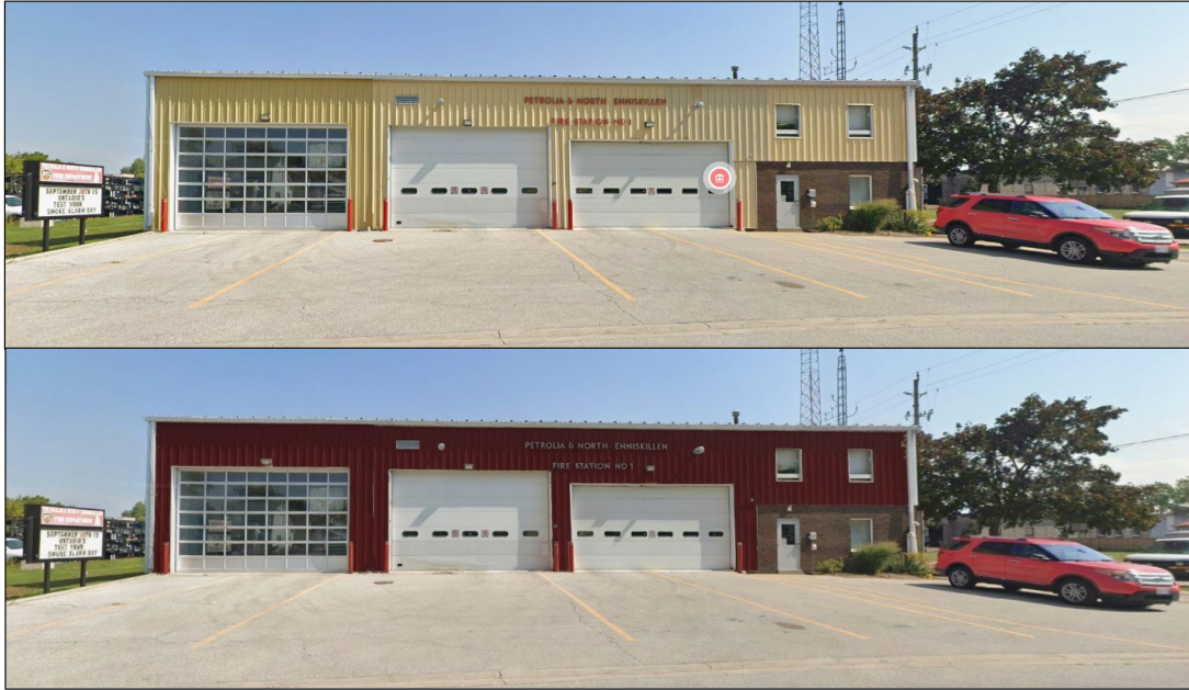
Figure 3: Current Fire Station Frontage (Upper) & Proposed (Below) - AI Rendering.

The preliminary/high-level cost of the proposed Fire Hall renovation work was previously estimated to be in the order of $850,000 excluding HST for interior works only (excludes work proposed for 2026 as described above). An updated cost estimate will be forthcoming from MISENER, based on the detailed design, following the incorporation of the Fire Committee's comments at the June 18 th meeting.