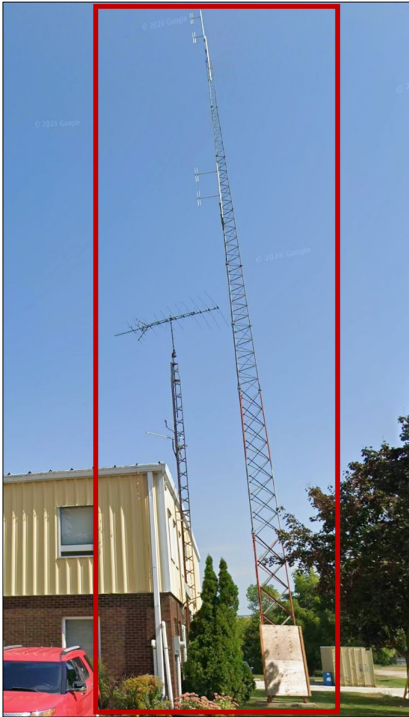
Figure 1: Two (2) Towers on South Side Requiring Removal.