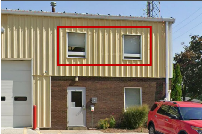
Figure 2: Two (2) Original Upper Windows with Vent Holes at Bottom.