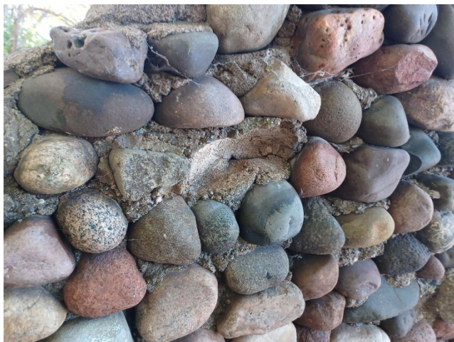
Figure 5 Stones falling out of fieldstone wall