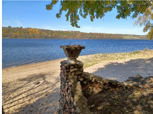
Figure 2 Stone plinths and concrete planters