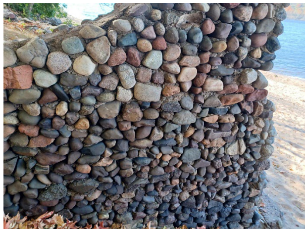
Figure 4 Fieldstone wall with worn mortar