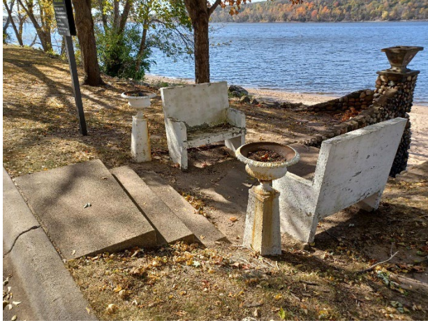
Figure 1 Cast Iron Bowls and Concrete Benches