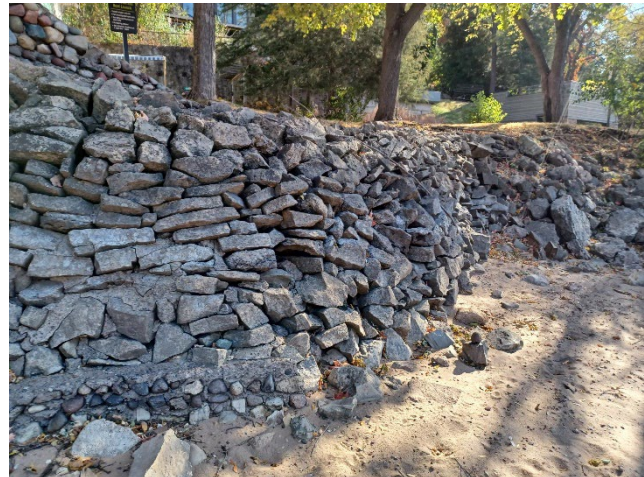
Figure 6 Limestone wall with no mortar